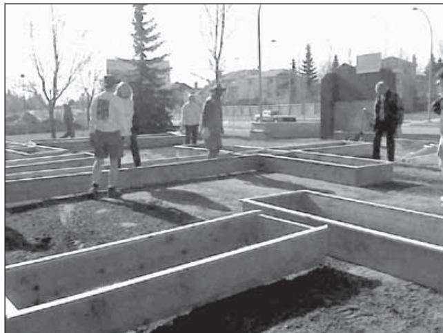
Participants in the garden project lay out the new raised beds made by local high school students.