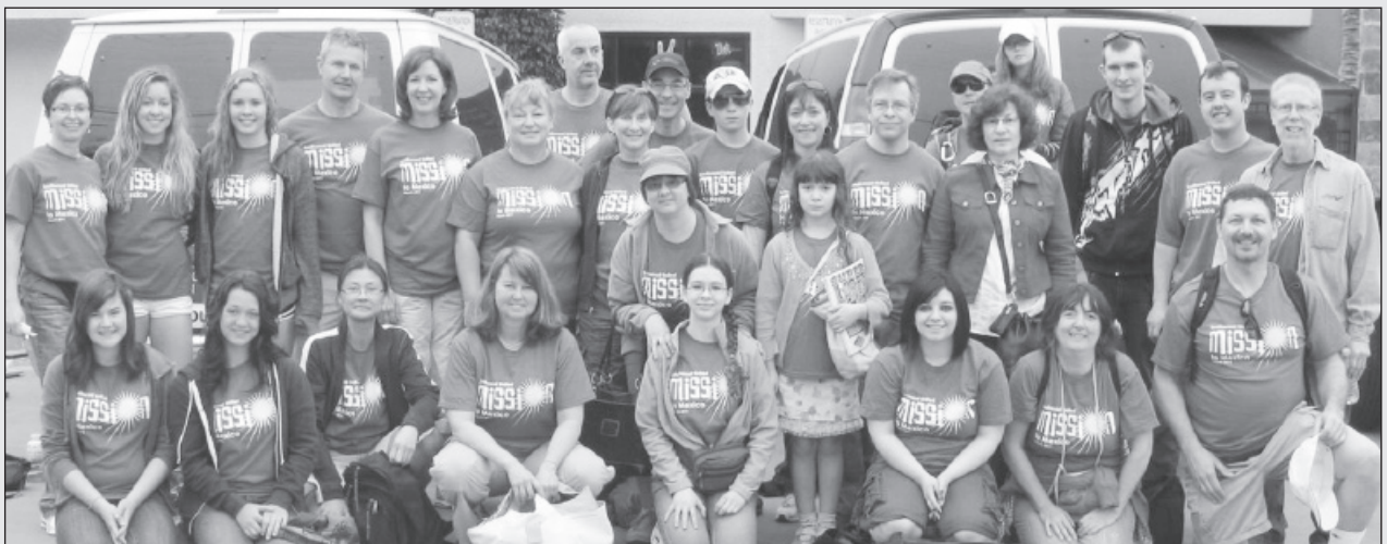
Southwood United team (Calgary) cooperated to build a home for 22 abandoned children in Tijuana, Mexico.