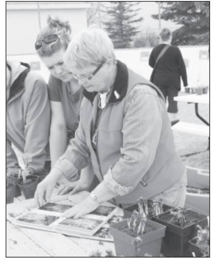
Plant Enthusiasts at Coronado United Church Mother's Day Tea and Plant Sale.